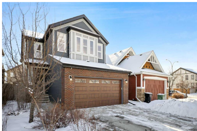
66 COPPERPOND HEATH SE

Family Approved - five bedrooms + two dens ** Extensive upgrades and superior quality, with 3500 square feet of air-conditioned luxurious living space. You will be impressed with the privacy of an oversized traditional homesite with a private south-facing backyard with a bespoke 13' x 12' covered deck. This seasonal, airy design provides relief from the sunniest to the snowiest days while providing an uninterrupted view of the surrounding gardens. Enjoy this convenient Copperfield Location - Steps away from the ponds, Ice rink, parks, pathways, schools, shopping, soccer, skate park, health care, transit, South Pointe Hospital, and the major south expressways. Living a community lifestyle makes Copperfield an outstanding, safe, and secure community. Rich curb appeal with architectural features - dramatic roof lines, 24' x 21' attached garage with wood-style detailed door & full-sized concrete driveway, covered entry, and brick-faced front complete this spectacular elevation. There are extensive upgrades throughout, and the details are superb. This is a must-see home! Chef's kitchen includes granite countertops, custom light wood shaker style cabinets/doors, extension trims, high-end KitchenAid stainless steel fridge/dishwasher/microwave/wall oven, gas cooktop range with 5 burners, recessed lighting, oversized central island, peninsula island with a flush eating bar & black granite under mount sink, extra cabinet storage & a